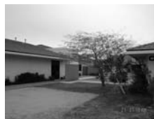
Our dormitory yard and training area

Guide Dogs of the Desert is an MD-4 Lions Endorsed project